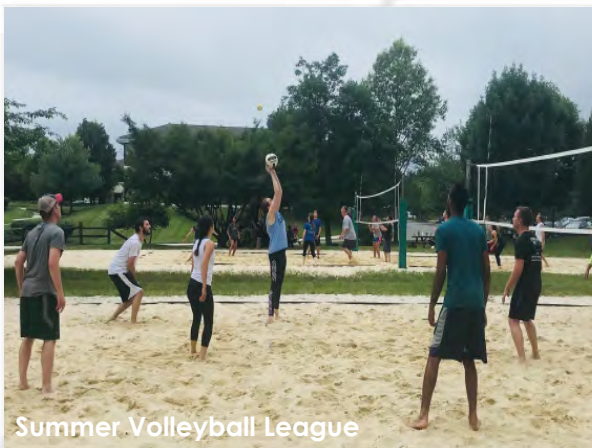
Summer Volleyball League