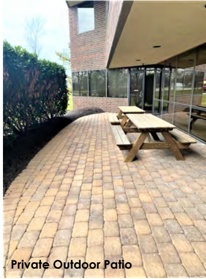
Private Outdoor Patio