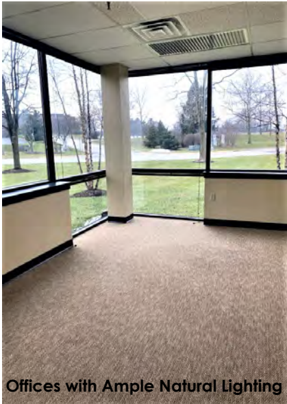
Offices with Ample Natural Lighting