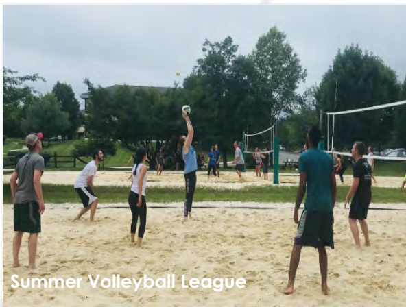
Summer Volleyball League