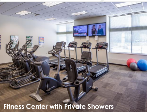
Fitness Center with Private Showers