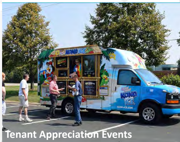
Tenant Appreciation Events