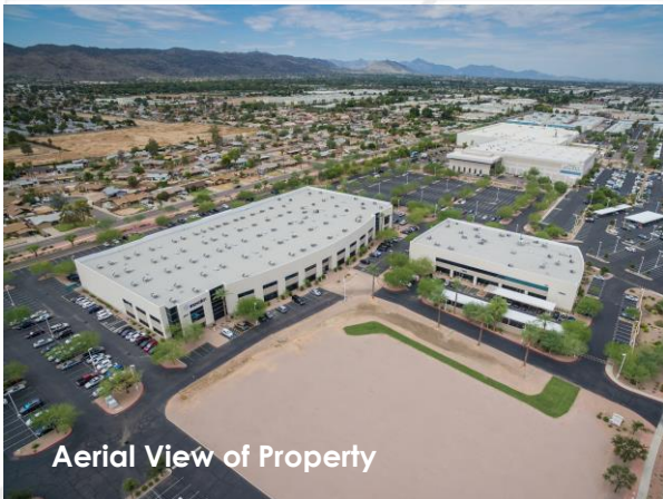
Aerial View of Property