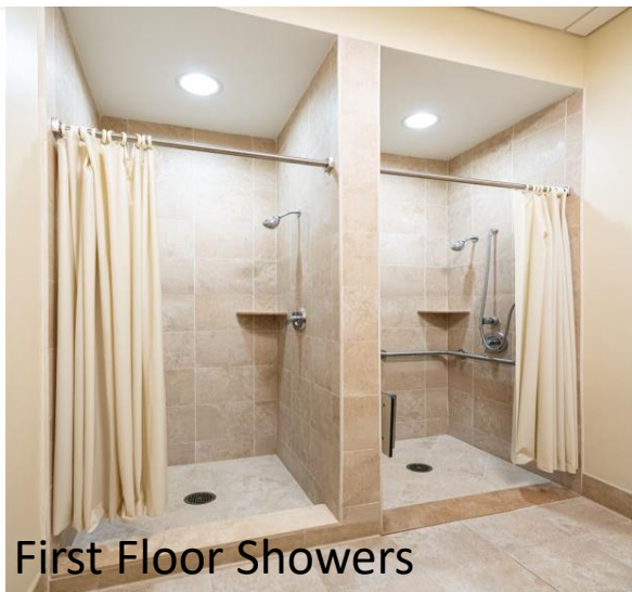
First Floor Showers

Asking Rent: $24.00/NNN 2021 OPEX: $13.18/RSF